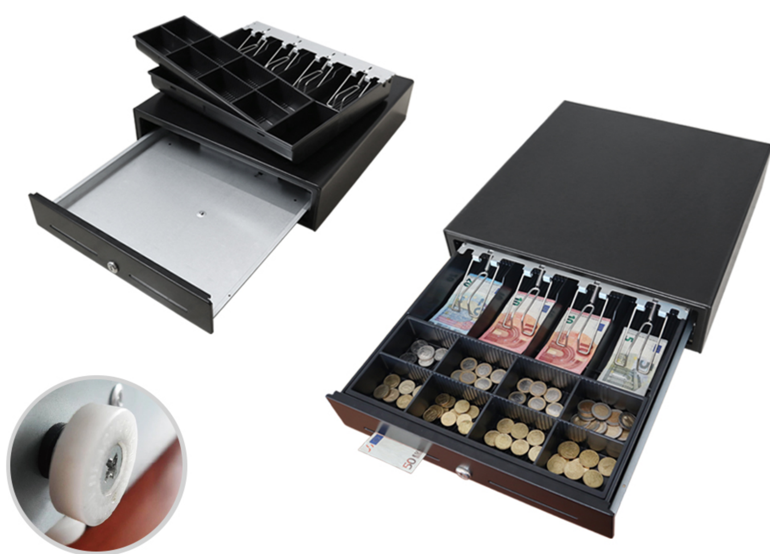
Durable Nylon Roller