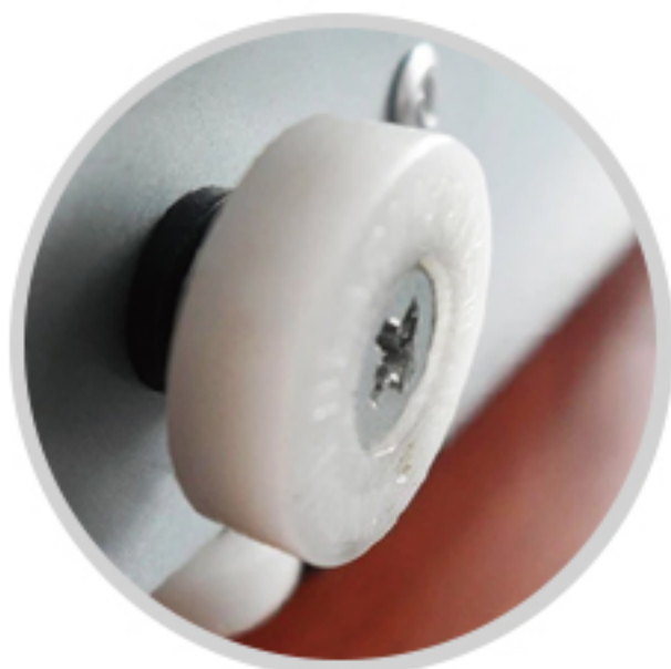
Durable Nylon Roller

Metal casing and drawer create a strong and secure cash drawer. The push spring and the high load-bearing rollers offer excellent performance and high durability. Tested to over 1 million open/-closing cycles.