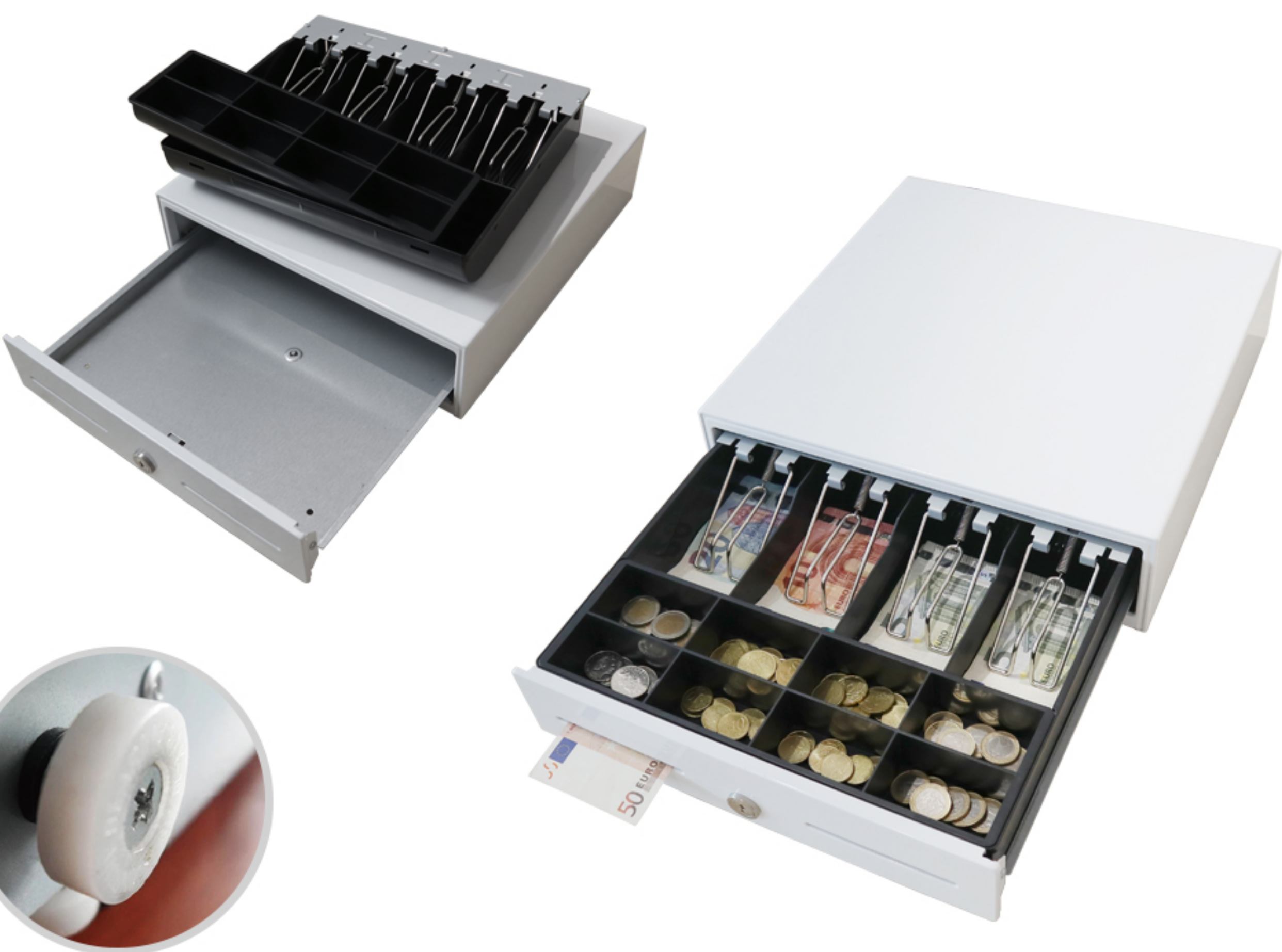
Durable Nylon Roller

Metal casing and drawer create a strong and secure cash drawer. The push spring and the high load-bearing rollers offer excellent performance and high durability. Tested to over 1 million open/-closing cycles.