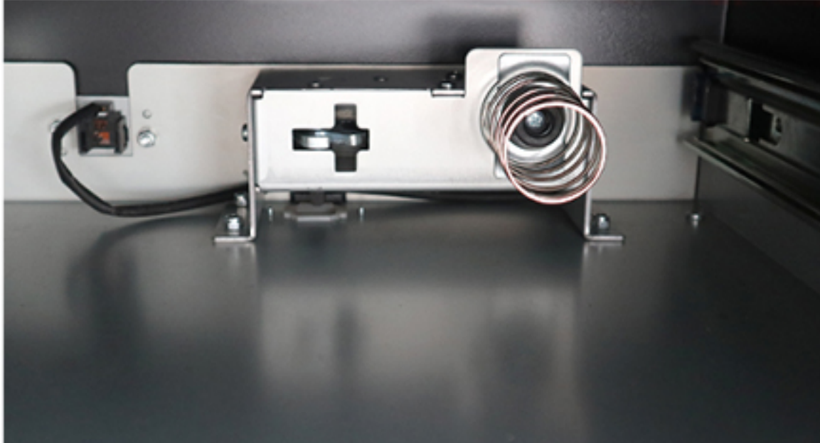
Solid Release Mechanism for more strong and security