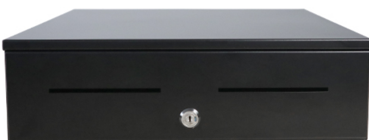
Artistic Drawer Front