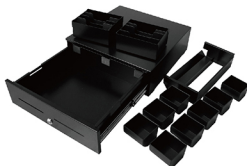
Separated coin cups make it easier for counting coins