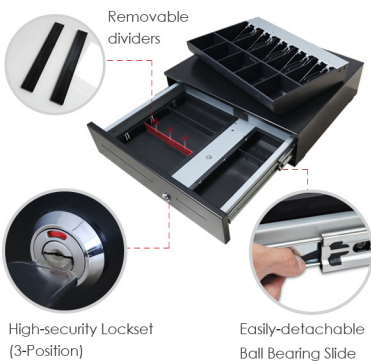
High-security Lockset (3-Position)

For more security and humanized operation.