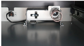
Solid Release Mechanism for more strong and security