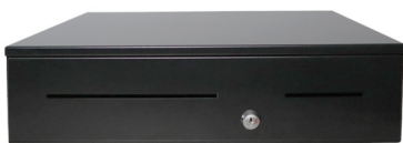
Artistic Drawer Front